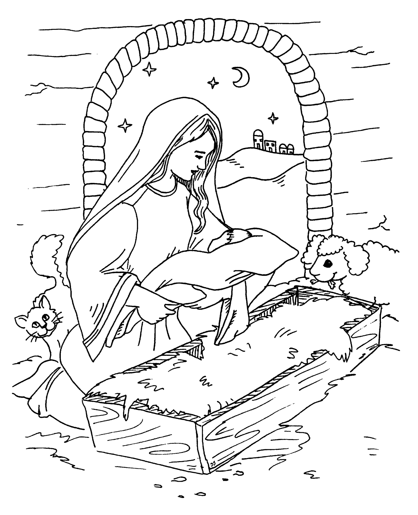
"And she brought forth her firstborn Son, and wrapped Him in swaddling cloths, and laid Him in a manger, because there was no room for them in the inn." Luke 2:7